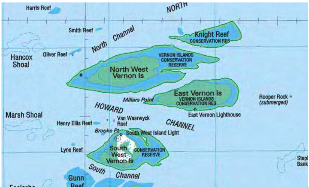
Figure 1: Vernon Islands and Knight Reef

In 1978 a claim was lodged for the Vernon Islands under the Aboriginal Land Rights (Northern Territory) Act 1976 , and the case went to hearing in May and September 2008, and again in April and May 2009. The Tiwi claim to ownership of the Vernon Islands was accepted by all relevant parties, and the Aboriginal Land Commissioner ordered parties to come to an extra-curial agreement. One of several issues requiring resolution is the design of a conservation management regime agreed between the NT Government and the Tiwi Land Council.